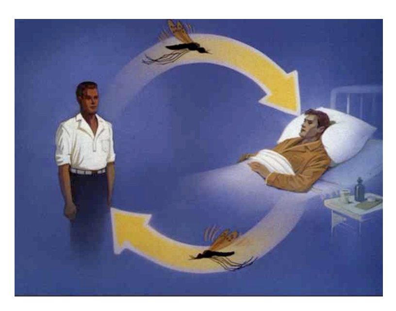
(The cycle of the malaria disease being spread by the mosquito in THE WINGED SQOURGE, 1943.)

The Winged Scourge opens with a wanted poster declaring PUBLIC ENEMY NUMBER 1, Anopheles Alias Malaria Mosquito as the narrator proclaims, "Wanted for willful spreading of disease and theft of working hours. For bringing sickness and misery to untold millions in many parts of the world." The wanted poster cuts to a stylized map of the world highlighting various regions afflicted with malaria. These images coupled with the serious narration that uses the metaphor of a wanted criminal is highly effective in grabbing the audience's attention right from the beginning. It is especially convincing since this film was made not that long after the Great Depression when criminals like Bonnie and Clyde, John Dillinger, Pretty Boy Floyd and the formation of the Federal Bureau of Investigation (FBI)—G-men—was fresh in the public's mind. The narrator even refers to the mosquito as, "...this tiny criminal is linked to the destinies of man in a cycle of disease transmission that could not exist without either man or mosquito. Each is solely dependent on the other for the existences of the dread malaria."