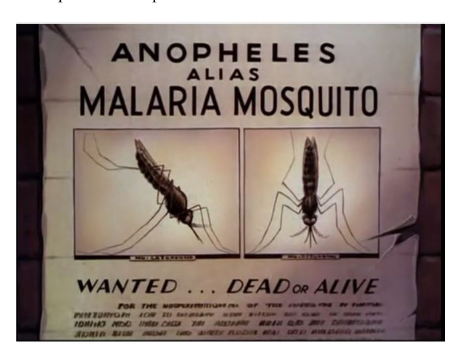
(The wanted poster from the opening of THE WINGED SCOURGE, 1942. ©Disney)

These films were then dubbed into Spanish and Portuguese with RCA waiving its sound processing royalties. Others followed suit by waiving fees and royalties on any of the films distributed by the U.S. Government. The use of existing films allowed the CIAA to get the program off the ground quickly as it started to commission new films that targeted specific topics like the spread of malaria.