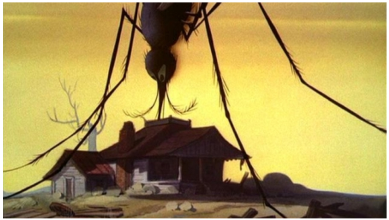
The Winged Scourge

(A strong graphic image of the Anopheles Mosquito from THE WINGED SCOURGE, "there is only one cause of malaria—the mosquito. Destroy the mosquito and you will wipe out the disease.")