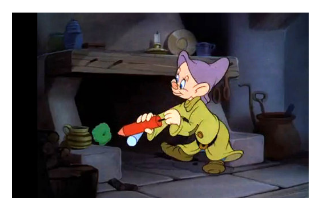
(Dopey spraying Paris Green insecticide around the inside of the cottage; THE WINGED SCOURGE)

The entire first half of the film effectively uses camera moves on still paintings with a minimal amount drawn animation. The background paintings are high quality, full of detail and effective in creating atmosphere and mood, coupled with the camera moves, giving each scene enough visual interest to move the story along. The backgrounds and animation in this film are comparable to the studio feature work of the day. But that changed quickly as subsequent Disney produced films for the CIAA were much simpler with flatter, more graphic backgrounds and the use of limited animation to keep costs contained.