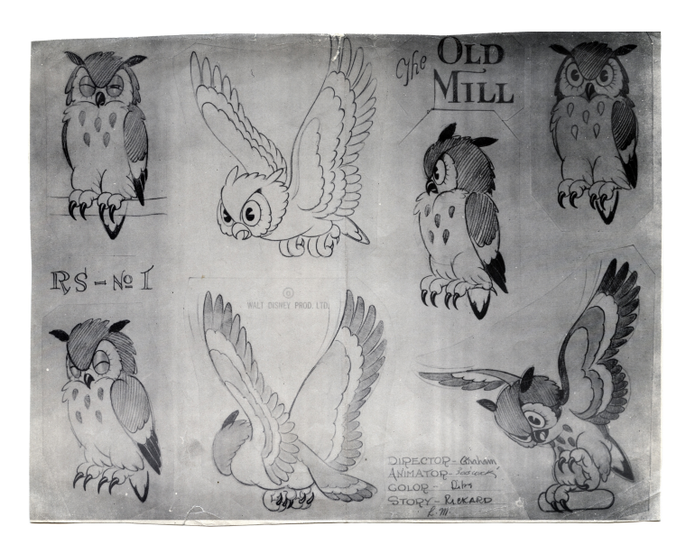
(Model sheet of the Owl from The Old Mill; ©Disney)

The film's centerpiece, an old abandoned windmill in the country is lush, detailed, and full of depth showcasing the masterful artistic skills of the studio at that time. The layouts were done by Terril Stapp, who had also done layouts on The Band Concert and Woodland Café . He went on to do art direction on Snow White and the Seven Dwarfs, Pinocchio, the Night on Bald Mountain and Ave Maria sequences in Fantasia, and Dumbo. The short begins as a tranquil scenic, dusk to nighttime, setting complete with nocturnal bats leaving the attic of the mill for the evening. This establishing shot draws the viewer in to explore the natural world with vignettes of fauna that inhabit the location until a summer storm starts to build, complete with blowing wind, pelting rain, and lightning further tattering the old mill. The film relies heavily on the rich, flourishing settings and the cinematography to help move the story along. The languid camera moves and longer scenes in the beginning of the short make way for the contrast of some fast cutting as the storm builds to a climatic crescendo of a lightning strike causing the mill to lean further to one side. As the storm subsides and passes, it makes way for daybreak and the bats return to their perch in the rafters of the old mill.