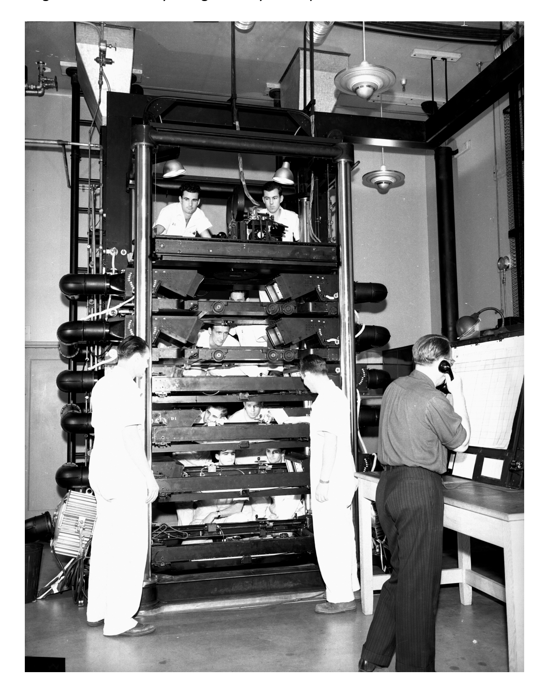
(The Disney Multiplane Camera used multiple camera operators to shoot a single scene.)

for the viewer. These scenic moments helped establish the feeling and atmosphere in a scene contributing to the visual storytelling in a way not experienced before.