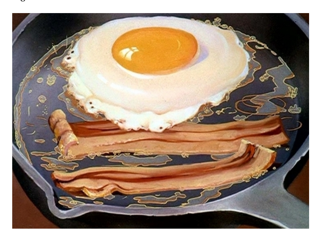
(Mmmmm, bacon and eggs cooking from Out of the Frying Pan and into the Firing Line ;)

Minnie Mouse starred as the typical all-American housewife doing her part for the war effort and her dog, Pluto. Minnie, at the stove cooking, offers Pluto some bacon drippings but before he delights in the treat, they are interrupted by a radio announcer explaining, "Don't throw away that bacon grease! Housewives of America, one of the most important things you can do is to save you waste kitchen fats." The announcer explains that kitchen fats; bacon grease, meat drippings, and frying fats, are needed for munitions to "help win the war." Waste fats can be distilled to produce glycerine which is used to make explosives. The announcer notes that two billion pounds of waste kitchen fats are thrown away every year, which is enough to make "ten billion rapid fire cannon shells" and "a belt 150,000 miles long, six times around the earth." He continues by saying that, "a skillet of bacon grease is a little munitions factory." The animation shows pouring bacon grease dissolving into bombshells and bullets.