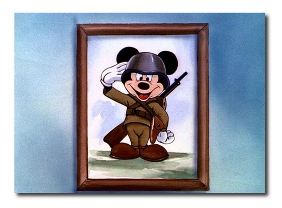
(Although there are other contemporary examples of Mickey Mouse in uniform, this is the only known one on film during WWII.)

A basket of French fries being lifted out a vat of frying oil is done in limited animation as the announcer says, "waste frying fats speed depth-charges on their way to crush Axis submarines." Depth-charges are shown firing off the deck of ship and then exploding underwater sinking an Axis sub. Again, this is reused animation that shows up in various war related films produced by Disney and not only helped to keep costs down, but also allowed for these films to be completed with speed.